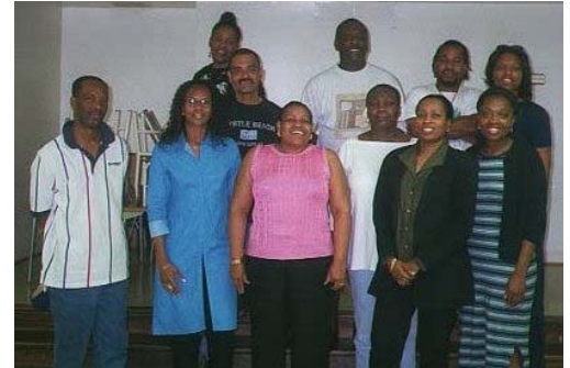
Members at the general meeting in May 2001